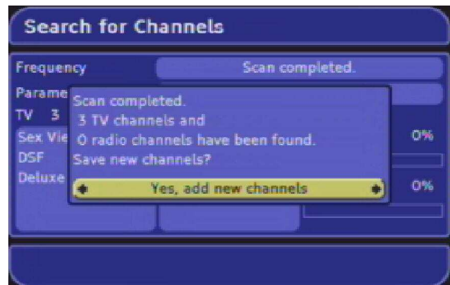
STEP 4 - SCAN COMPLETED - PRESS OK ON REMOTE

4. The Scan completed screen indicates that that the decoder has found the DigiPac channels and is ready to save them. Press OK on the remote control to add the channels and finalize the setup.