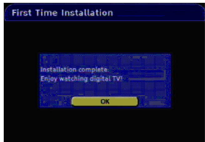
STEP 5 - PRESS OK ON THE REMOTE CONTROL

5. Installation complete screen. Confirm the installation and exit the setup menus by pressing OK on the remote control.