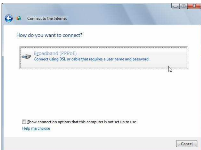
step 4: select Broadband (PPoE)

4. Click on Connect to the Internet, then select Broadband (PPPoE).