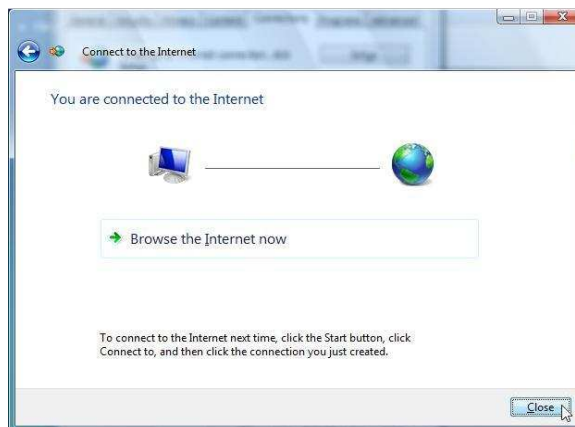
step 5: connection test

6. Vista OS will now test your Internet connection, afterwards click Close to finalize the setup wizard.