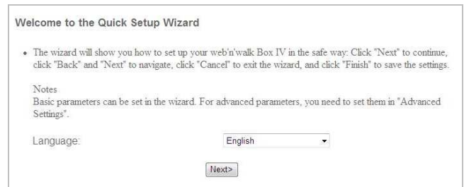
step 5: select English

5. NOTE: if the menu is in German, select English from the Sprache (Language) pulldown, then click on Next .