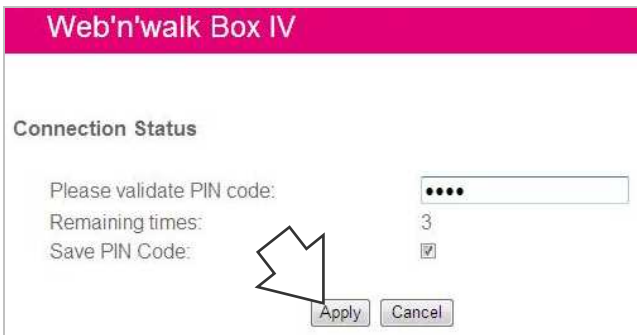
step 3: Validate PIN

3. Type in the PIN for T-Mobile SIM card, click on Apply .