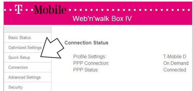
step 4: select Quick Setup

4. After the PIN is verified, click on Quick Setup .