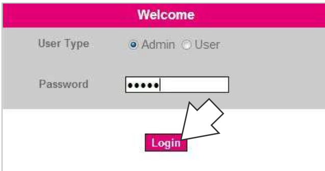
step 2: Login

2. In the welcome screen: select Admin , type the word admin into the password field, then click on Login .